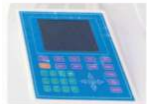
Soft touch keypad