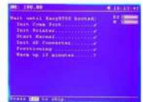
Display (Graphic LCD 320 x 240 Dots)