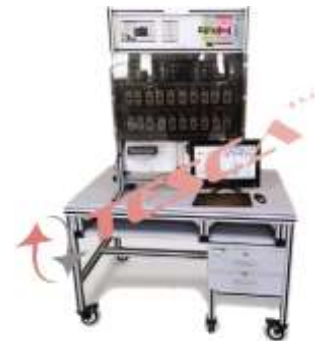
RTU Unit with HMI