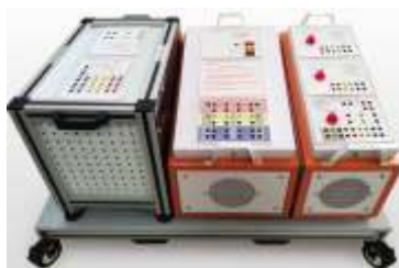
Under Trolley resources

Note: Specifications are subject to change.