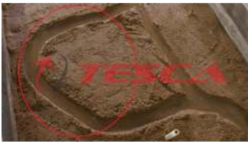
OX BOW FORMATION