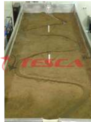
Meander – A bend in the river