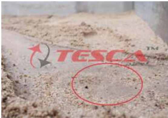
PLUNGE POOL UNDER WATERFALL