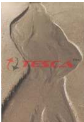
Braided channel plain form

- Mains ON/OFF; - Mains Indicator; - Water Pump ON/OFF; - Hydraulic Motor ON/OFF and UP & Down press button for tilting arrangement; - Solenoid Valves ON/OFF Switches.