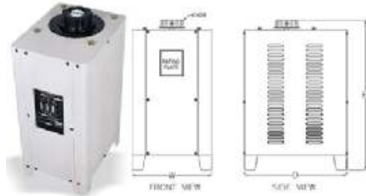
P3 - Variac - Three Phase Portable Table / Floor Mounting Enclosed Input 415V A.C., Output 470V A.C., 50-60Hz