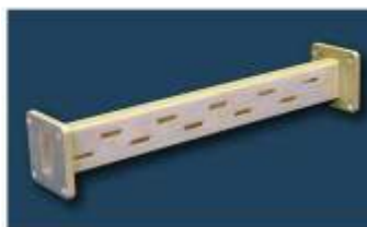
Order Code - 10537 Slotted Broad Wall Antenna