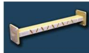
Order Code - 10538 Slotted Narrow Wall Antenna