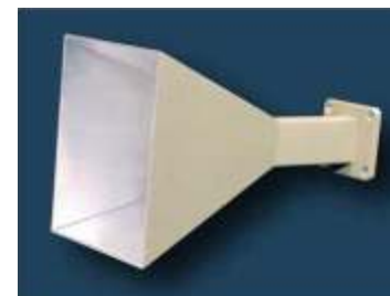
Order Code - 10534 Pyramidal Horn