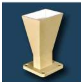
Order Code - 10531 Pick-up Horn Antenna