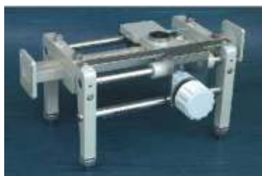
Order Code - 10539 Slotted Section

Slotted section is used to measure various measuring parameter in microwave. for example to determine VSWR, phase and impedances. These consists of a slot in center of waveguide in which we can connect a probe and probe can be moved in slot and position of probe can be measured by its Vernier scale. The travel of probe carriage is more than three times of half wavelength.