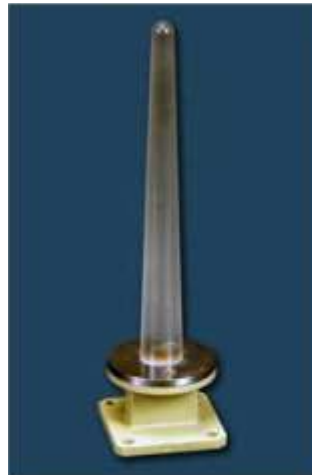
Order Code - 10508 Dielectric Antenna