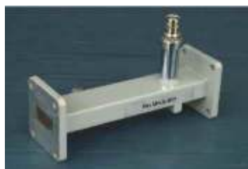
Order Code - 10532 Pin Modulator

Note: Specifications are subject to change.