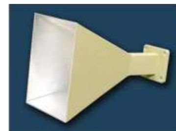
Order Code - 10541 Standard Gain Horn Antenna