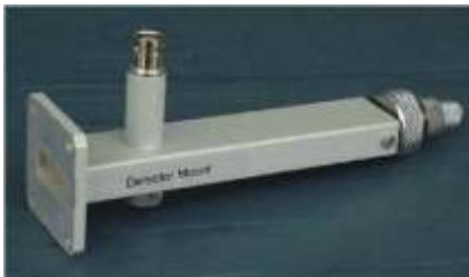
Order Code - 10507 Detector Mount

The crystal detector can be used for the detection of microwave signal. At low level of microwave power, the response of each detector approximates to square law characteristics and may be used with a high gain selective amplifier having a square law meter calibration.