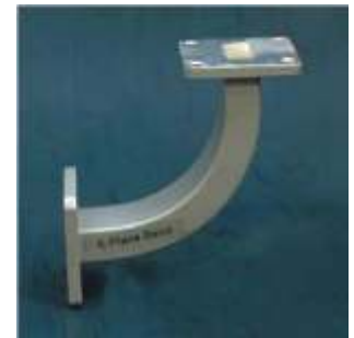
Order Code - 10509 E-Plane Bend

In measurements it is often necessary to bend a waveguide by some angle. Waveguide bends in E and H plane of 90° is normally available. Waveguide bends designed by a section of rectangular waveguide and flange.