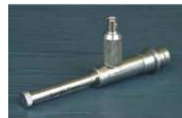
Order Code - 10543 Tunable Probe

Tunable probes are very useful devices to measure the SWR and Impedances. Tunable probe is consists of a crystal detector and a small wire antenna in coaxial housing. Its depth of penetration into the slotted section is variable.