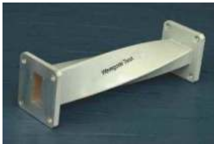
Order Code - 10546 Waveguide Twist

Waveguide Twist is used to change the plane of Polarization of a wave Guide transmission line . Twist is made from a section of waveguide which has been precisely twisted. 900 twist is a standard available model.