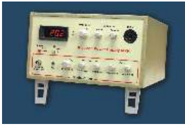
Order Code - 10501 Klystron Power Supply