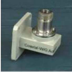
Order Code - 10504 Coaxial WaveGuide Adaptor

Adaptors transform waveguide impedance to coaxial impedance. Adaptors consist of a short section of waveguide with a probe transition mounted on broad wall. Power can be transmitted in either direction. Each adaptor covers the 50% of the waveguide.