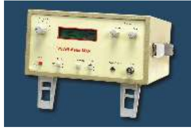
Order Code - 10502 VSWR Meter