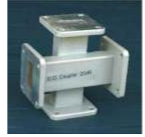
Order Code - 10506 Cross Directional Coupler 20 dB

Cross Directional Coupler consists of two waveguide sectional joint at (90°) with the coupling element mounted into the common broad wall.