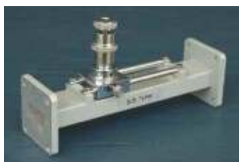
Order Code - 10536 Slide Screw Tuners

Slide Screw Tuner is a very useful component in a microwave laboratory. It is mainly used for Impedance measurement. Its tuner can be adjusted for low and high impedance position.