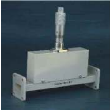
Order Code - 10544 Variable Attenuator