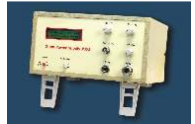
Order Code - 10503 Gunn Power Supply