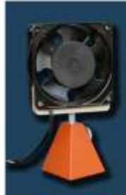
Order Code - 10505 Cooling Fan