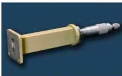
Order Code - 10540 Solid Dielectric Cell

These are used to measure dielectric constant of any solid material these consists of a cavity for keeping the sample and micrometer to read the position of sample.