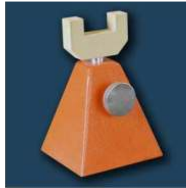
Order Code - 10545 Wave Guide Stand