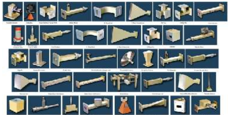
Microwave Components Chart

Note: Specifications are subject to change.