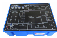
28512 Multiplexer / Demultiplexer