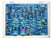
28526 Fibre Optics Communication Trainer