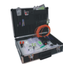
28520-21 Fiber Optic Connectorization Kit