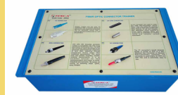
28522 Fiber Optic Connectors Kit