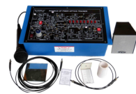
28508 Physics of Fiber Optics Trainer