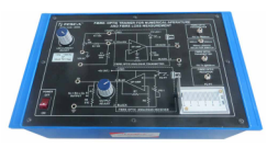
28505 Fibre-Optic trainer